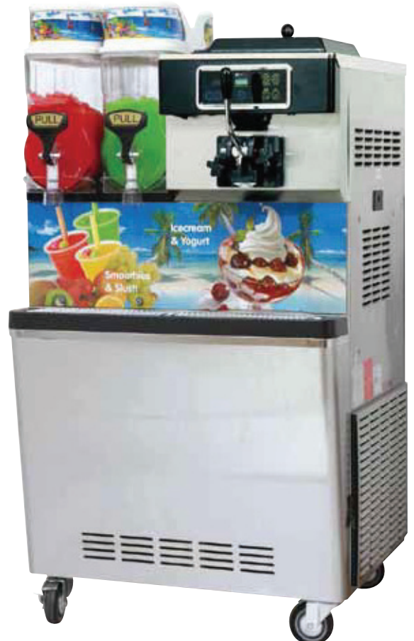
ALL IN ONE