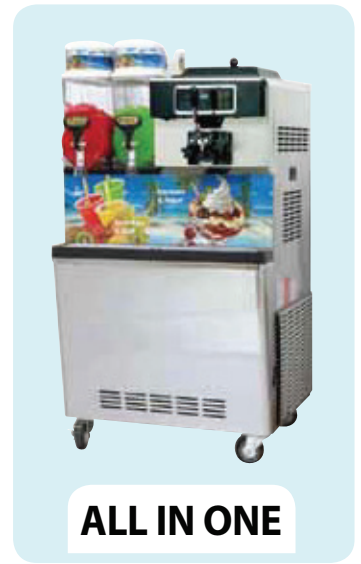
ALL IN ONE

We Are Also the Major Wholesaler of Granita Slush Syrup, 99% Juice Mix & Cocktail Base Mix with a 12-24 Month Best Before Date